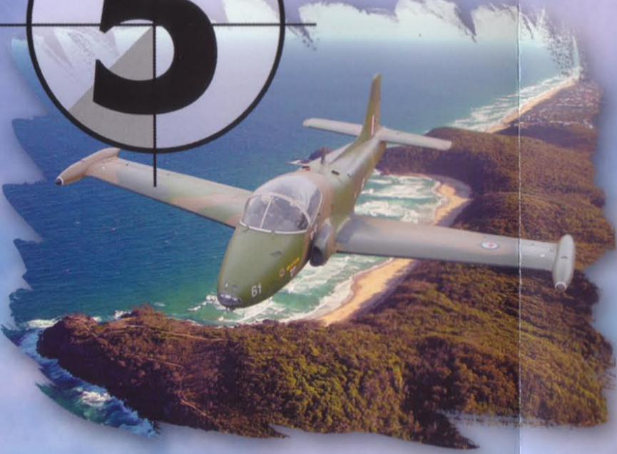
Begin your planned sortie as you experience up to 4G's during air combat manoeuvres.