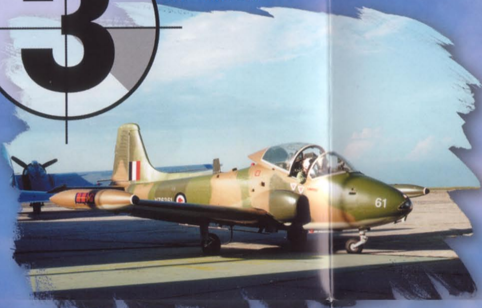
Start the engine and begin the process of warming the Rolls Royce Viper jet turbine, then taxi into position on the runway ready for take off.