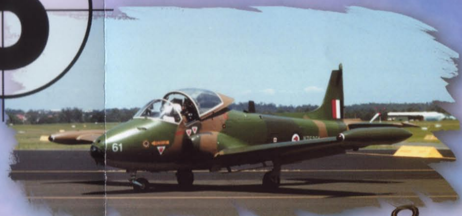
Back to land. Feel the excitement as the tyres hit the runway, then taxi back for your final debriefing session.