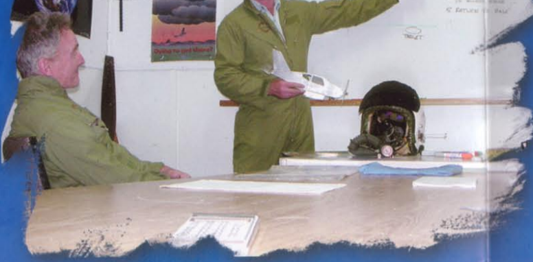
Start at the briefing room for a detailed preflight briefing.