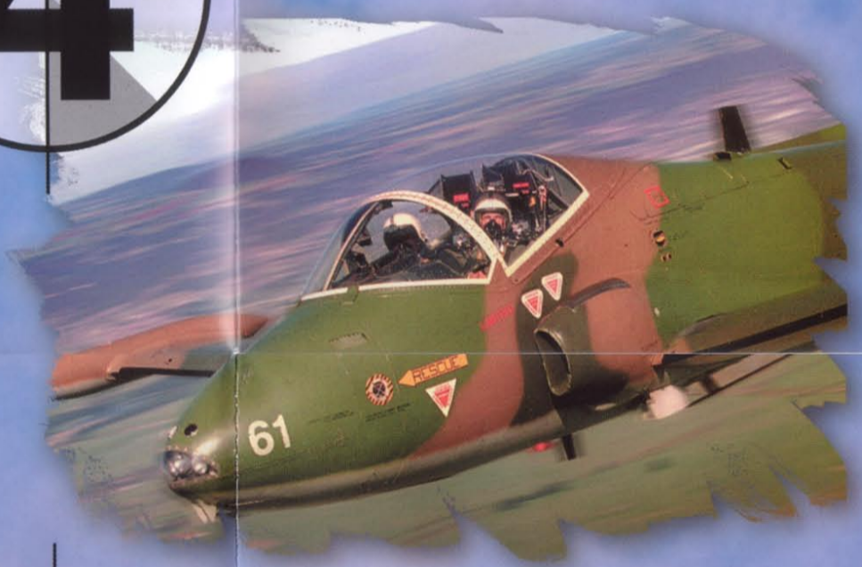
Blast off, airborne in 300 metres, reach 400kph in under 1000 metres, you are speeding down the runway and feeling the awesome power as the aircraft leaves the ground.