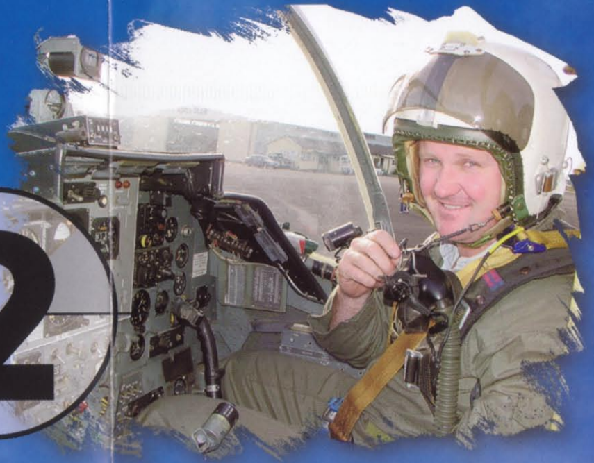
Strap in and be familiarised with all controls, check safety equipment and oxygen masks.