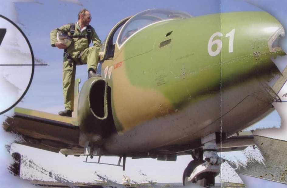
"You've done it!" and you have your own certificate to prove it. Wow! What a feeling.